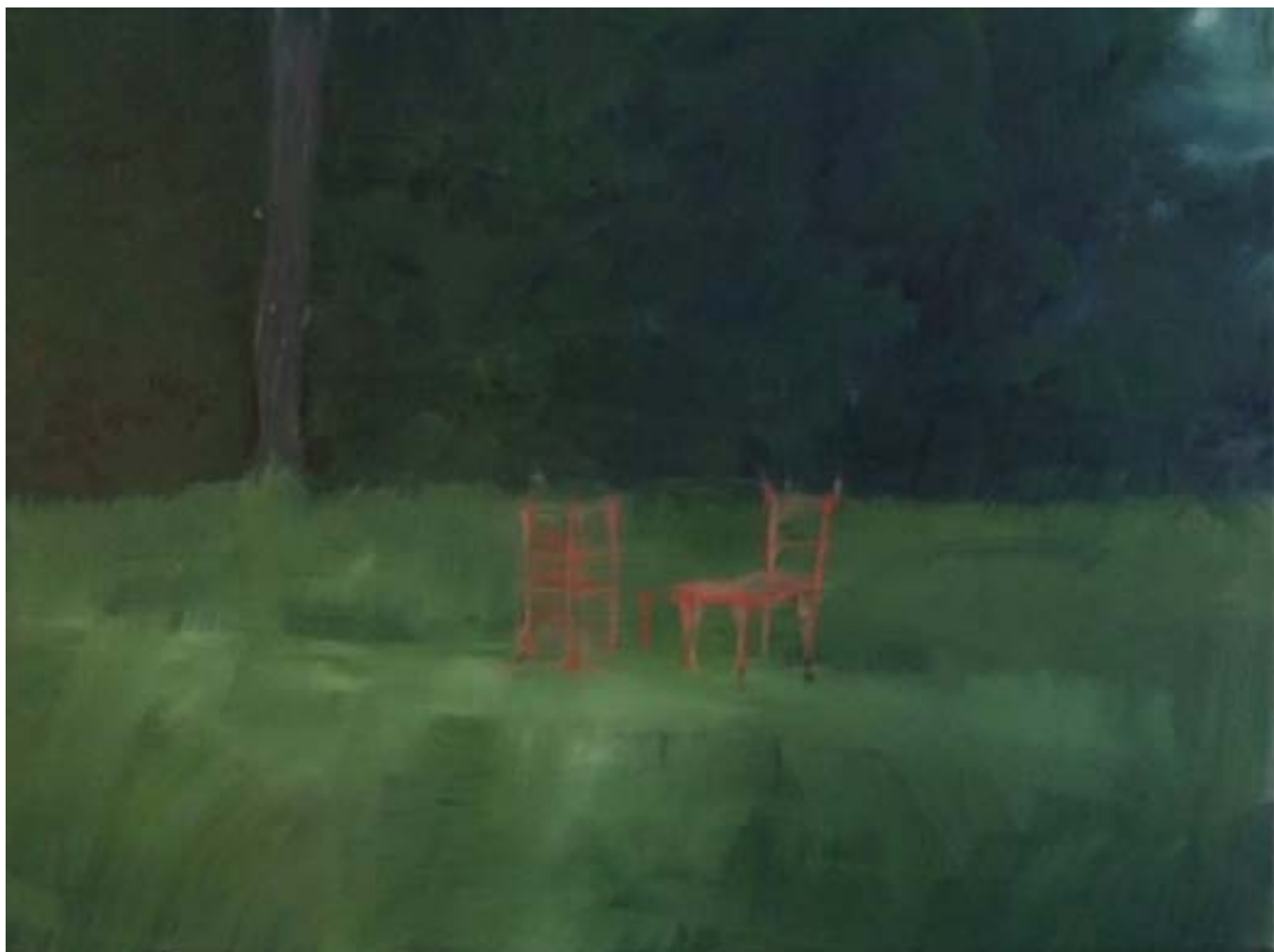
Waldwohnung (Home in the woods) - 2013 Oil on canvas 30 x 40 cm