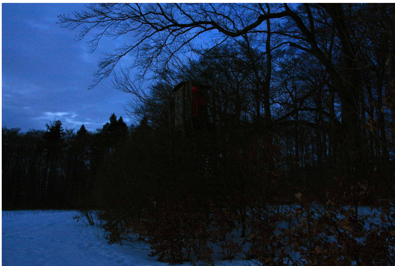
Untitled, from the series The Hide (Elm) - 2011 Colour print, dibond and acrylic glass 40 x 60 cm each