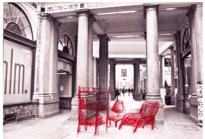
Untitled, from the series Restless Home - 2012 Oil pastel on black and white print 19 x 27 cm each