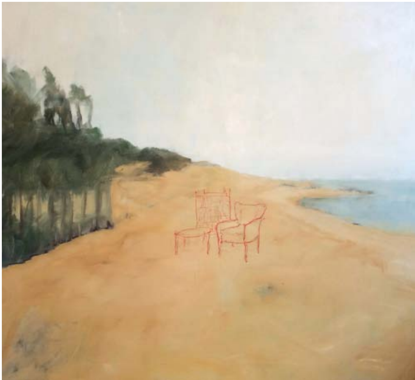
Haus am Meer (House at the sea) - 2013 Oil on canvas 100 x 110 cm