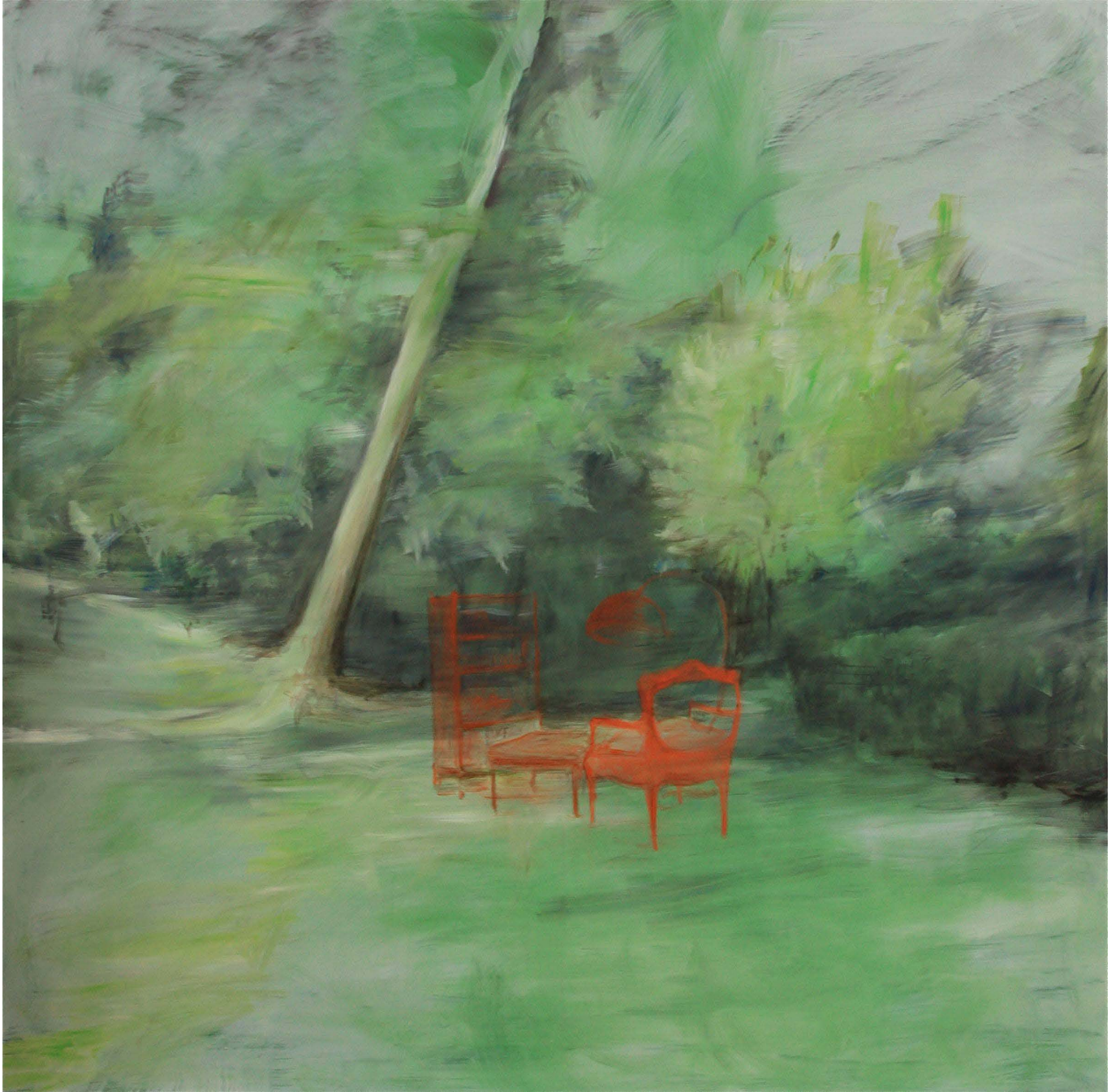
Restless Home - 2011 Oil and acrylic on canvas 200 x 200 cm