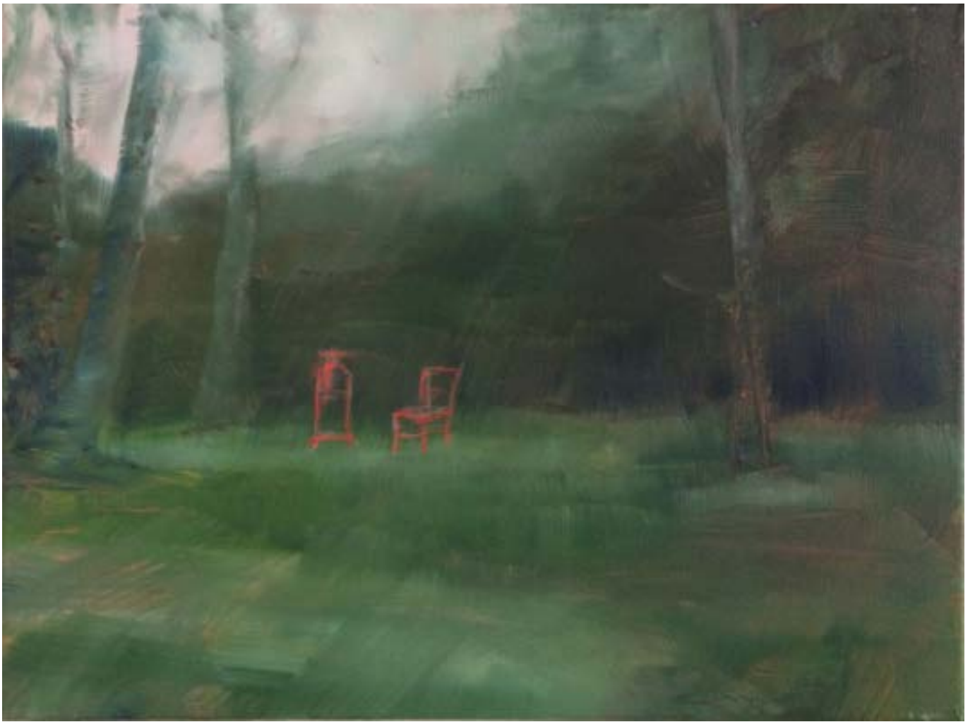
Waldwohnung (Home in the woods) - 2013 Oil on canvas 30 x 40 cm