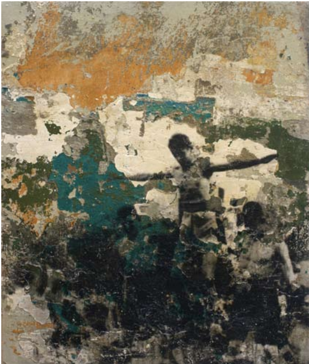
Neighbours: Prešernova ul. 2 II Ptuj - Budapest, 2010 Silver Gelatine Print on Mixed Media (Removed Wall Paintings) on Canvas, 60 x 70 cm