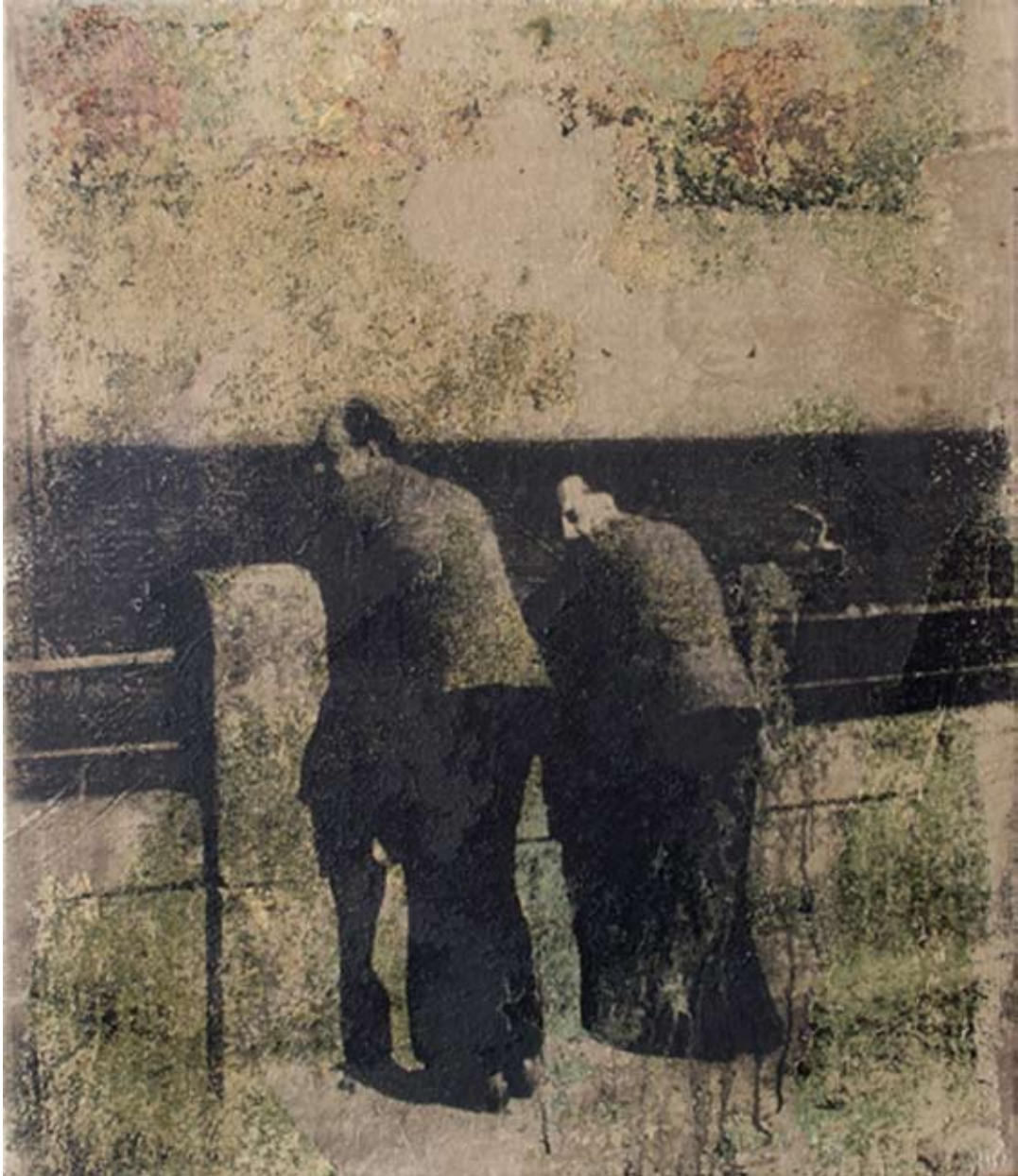
Neighbours: Simon-Dach-Strasse 8 II - Berlin, 2010 Silver Gelatine Print on Mixed Media (Removed Wall Paintings) on Canvas, 60 x 70 cm