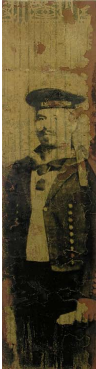
Neighbours: Kinzigstrasse 9 I - Berlin, 2010 Silver Gelatine Print on Mixed Media (Removed Wall Paintings) on Canvas, 35 x 135 cm