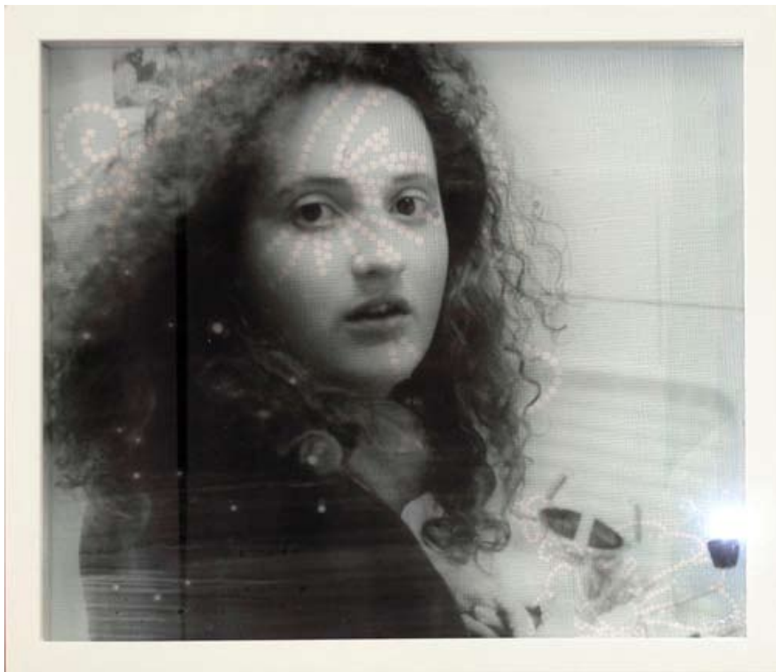
Deutsche Gemütlichkeit: Studentin (Glas), 2008 Silver Gelatine Print on Glass in Front of Wall Paper on Plywood, 46 x 34 cm