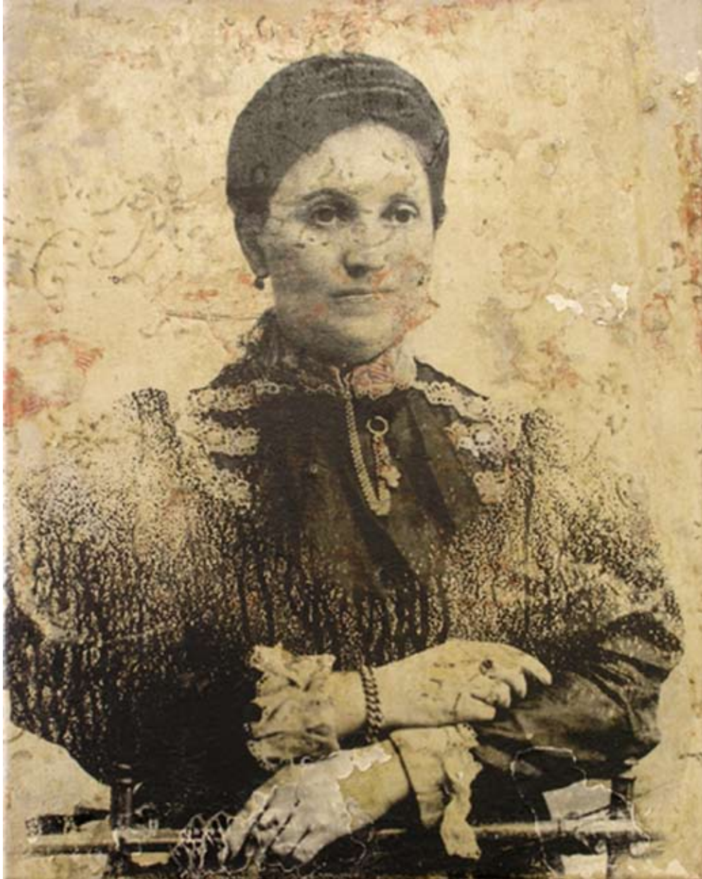
Neighbours: Nyár utca 4 IV - Budapest, 2010 Silver Gelatine Print on Mixed Media (Removed Wall Paintings) on Canvas, 40 x 50 cm