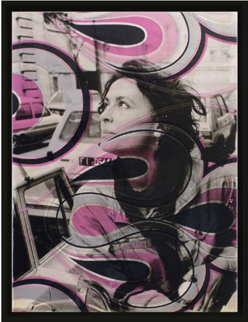
Deutsche Gemütlichkeit: Kunststudentin 1b, 2008 Silver Gelatine Print on Wall Paper on Plywood, 34 x 46 cm