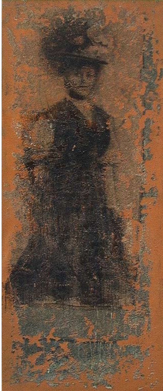
Neighbours: Oderstrasse 14 I - Berlin, 2003 Silver Gelatine Print on Mixed Media (Removed Wall Paintings) on Canvas, 55 x 135 cm