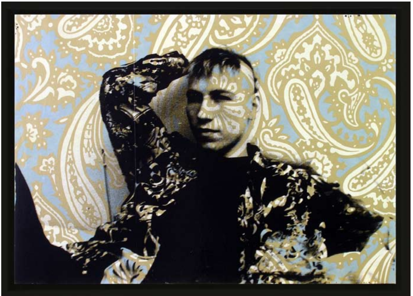
Deutsche Gemütlichkeit: Guitarrist 1b, 2008 Silver Gelatine Print on Wall Paper on Plywood, 71 x 50 cm