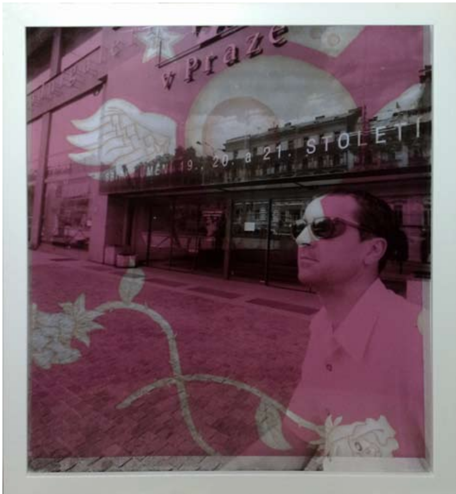
Künstler-Kurator 2c, 2009 Silver Gelatine Print on Glass in Front of Wall Paper on Plywood, 34 x 46 cm